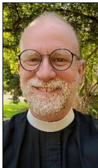
Priest and Rector